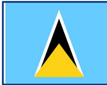
St Lucia's flag